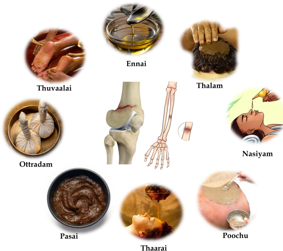
Figure 2. Types of External Applications for Enbu Murivu