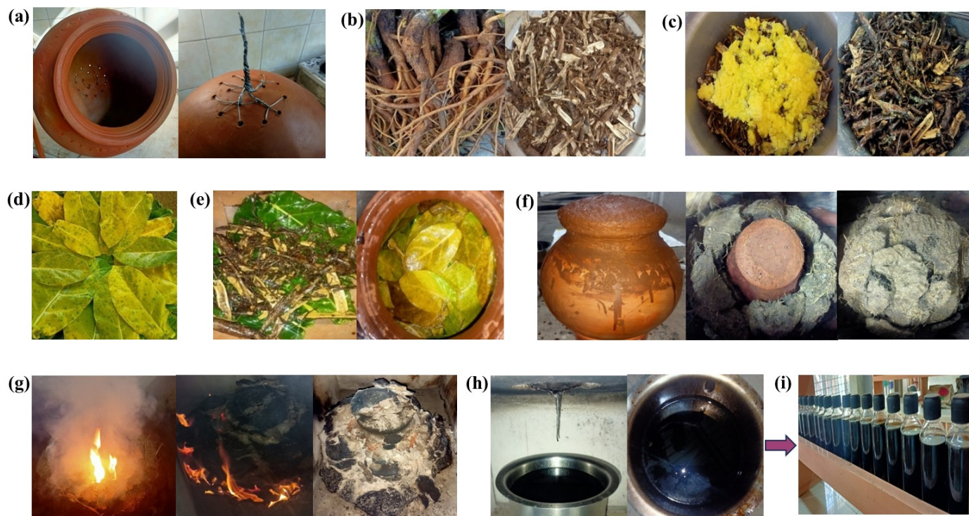
Figure 1. Standard operating procedure for preparation of SKN. (a) Pierced Mud pot with iron wires, (b) Roots of Argemone mexicana . Linn, (c) Dried Argemone Roots coated by cow's Ghee, (d) Leaves of Calotropis procera . Linn, (e) Arranged alternative layers of roots and leaves within a mud pot, (f) Sealed mud pot by mud pan and covered with layers of cow dung cakes, (g) Processes of Incineration ( Putam ), (h) Collection of oil ( Kulitailam ) in a clean vessel, (i) Swasakasa Nei .