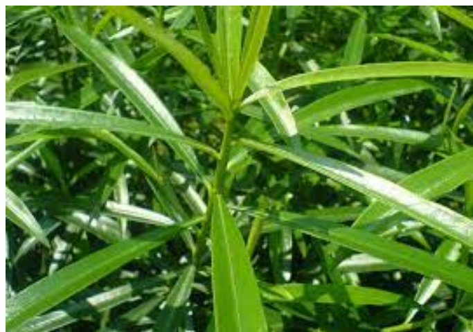
Figure 1. Thevetia peruviana leaves

Thevetia peruviana Leaves (Figure 1) were collected in its natural growing environment in Lefkosia, Cyprus. The plant was presented for recognition at the Department of Agriculture, Cyprus International University. The plant was dried at ambient temperature and grounded in an electrical mill. The grounded raw material was passed via a weave filter size of 60 mm to obtain a fine powder. It was subsequently used to prepare the extracts (n-hexane and ethanol). The Crude extracts were prepared in compliance with the cold extraction method. Furthermore, 30 grams of dried powder was soaked in 300 ml of ethanol and hexane respectively and kept for 48 hours. After 48 hours, the mixtures were filtered utilizing the Whatman filter paper and dried in the vacuum using the rotary vacuum evaporator (Barupal et al., 2019).