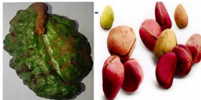
Figure 1. Pod and seeds of Cola nitida nut

In the literature, Cola nitida (Family: Malvaceae) is described as a tree that can reach a height of 25 meters. The large branches and stems are cracked and mixed with whitish or greyish lichen spots. The leaves have long petioles and vary in shape from obviate to oblanceolate, measuring about 15 cm in length. The ovary is yellow, light yellow, or lemon yellow. The fruit consists of 1 to 10 elongated green follicles, each containing 4 to 10 seeds. The seed, red, pink, or white in color, is also protected by a vitreous white arillus and includes 2 cotyledons, very rarely fragments. The inflorescences are panicle-like cymes with terminal flowers that grow in a determinate manner. C. nitida is functionally monoecious, with male and hermaphrodite flowers blooming in the same order. Male and female flowers are either produced on distinct inflorescences or coexist on the same inflorescence (Adebola, 2011; Bohou & Ijb, 2009; Burdock et al., 2009).